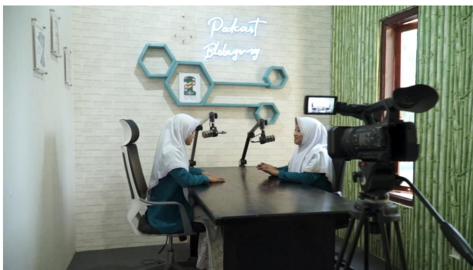
Figure 3. Audio and Video Production Studio for College Students

rector has a strong role in creating an innovative and collaborative academic culture in the pesantren-based university environment. The policy support provided opens up space for lecturers to be creative and adapt to technological developments through the development of digital teaching media and collaboration across study programs. This indicates that visionary leadership policies are able to drive learning transformation towards a more dynamic, relevant, and responsive model to the demands of digital disruption without abandoning the identity of pesantren values (Halimah et al., 2024). The following is an image that shows the use of digital as a form of creativity for leaders in answering the challenges of digital disruption: