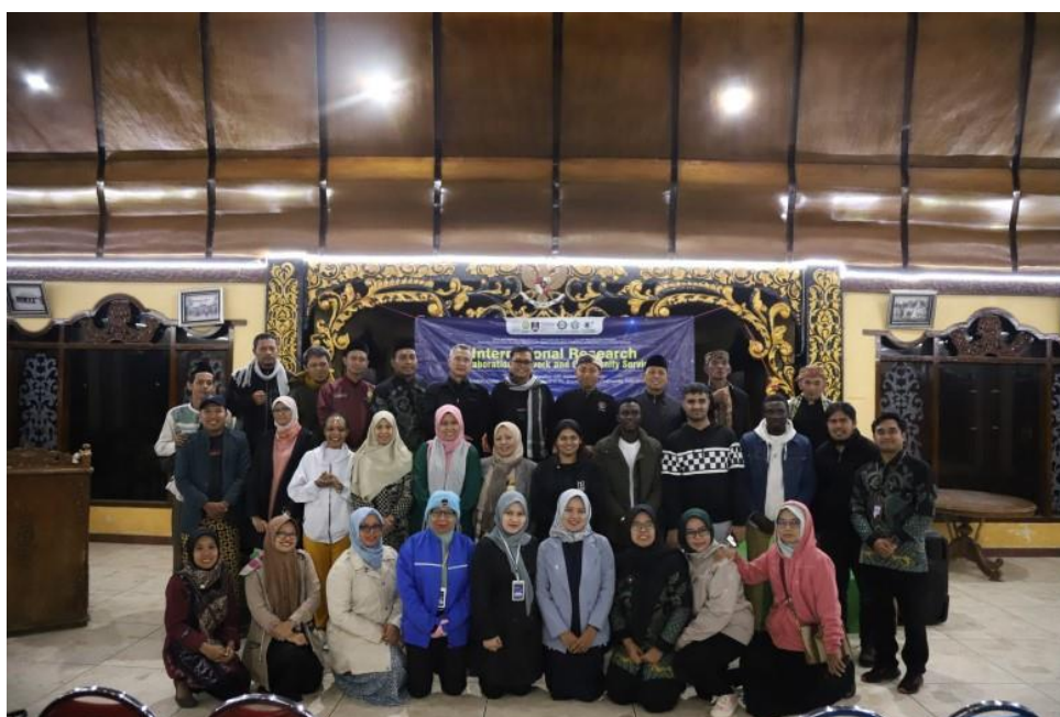
Figure 4. International Collaboration in the Field of Research and Community Service

challenge of disruption by seizing digital space (Kholili et al., 2024). This initiative shows a smart adaptation, where the campus is no longer a passive consumer of technology, but an active producer that uses media creativity to strengthen Islamic identity in the digital era, while building a relevant learning ecosystem for the younger generation (Muslim, 2024). Here is a picture that presents international collaboration activities in the field of research and community service: